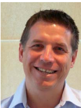
Leather in Ireland: a focus on skills management